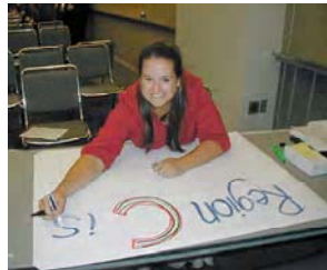
Making Spirit Awards Banners