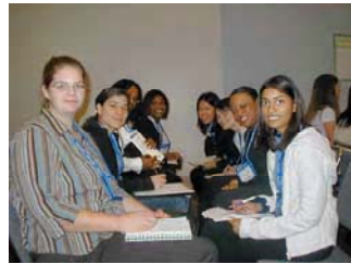
Region C Joint Meeting