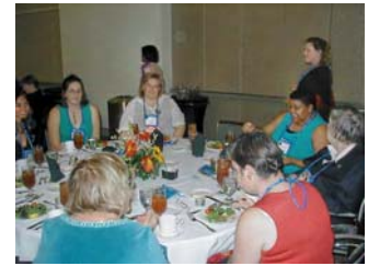
Members at Celebrate SWE